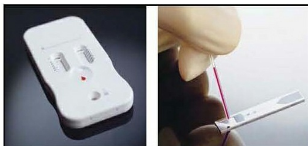
Figure 6 – Examples of Disposable Tests for Doctor's Office or Home Use

Disposable Tests for Doctor's Office or Home Use: Disposable tests for use in a doctor's office or at home are single shot disposable devices which can be provided by a clinician as part of a screening program or purchased over the counter at any chemist shop or pharmacy and test a drop of blood taken from a finger prick. The test can be administered at a doctor's office using a point-of-care device or performed at home using a home testing kit, neither of which requires laboratory involvement. Thus, the patient experiences considerably lower costs using these tests as compared to traditional laboratory tests. The format of the self-use home testing kit is very easy to use and reproduce and does not rely on laboratory processing. There are currently no useful diagnostics tests suitable for mass screening for cancer in general through a simple self-use home testing kit. Figure 6 below shows a basic home use test on the left which displays the results of the test in the two windows, similar to a pregnancy test. The test on the right is more sophisticated and plugs into a meter or the USB port of a computer for analysis and interpretation allowing results to be sent directly to a clinician.