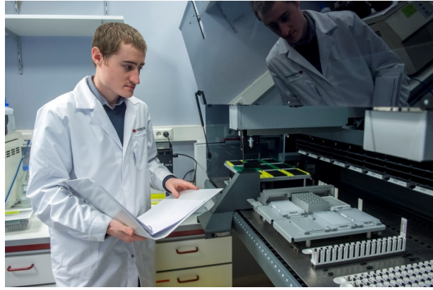
Figure 3 – Example of lab instrument for running ELISA tests