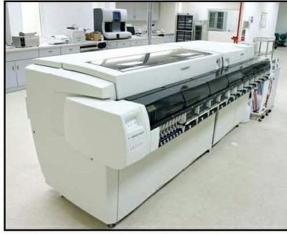
Figure 4 – Example of an Automated ELISA System

One option that may be available to us in the future is to license our Nucleosomics ® technology to a global diagnostics company. Another option that may be available to us is to sell manual and/or semi-automated 96 well ELISA plates for use by these laboratories. We do not have an anticipated timeframe for licensing our Nucleosomics ® technology or selling ELISA plates to laboratories, although we are actively seeking such relationships worldwide.