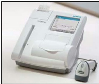
Figure 5 – Example of a Point-of-Care Device

Point-of-Care Devices: Point-of-care devices are small instruments that perform tens of ELISA tests per day rapidly on blood taken from a finger prick. The instruments can be implemented in any oncology clinic and tests can be performed during patient consultations. We intend to contract with an instrument manufacturer to produce these instruments for point-of-care NuQ ® testing for the oncologist's office, general doctor's office or at home testing. We aim to enter the point-of-care clinical market in Europe and the United States about 18 months after launch on the manual platform, as we will first need to adapt test prototypes to these small instruments and demonstrate their success in the greater diagnostics market before these products will be adopted by others in the industry. At this stage of its development, we cannot accurately predict the costs to manufacture these devices or their selling price. As of the date of this report, we have not entered into any discussions or negotiations regarding the manufacture or sale of these devices. See Figure 5 for an example of a point-of-care device.